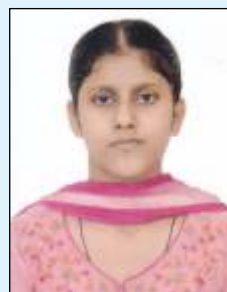
Mansi BCA - Ist Sem 79.7%