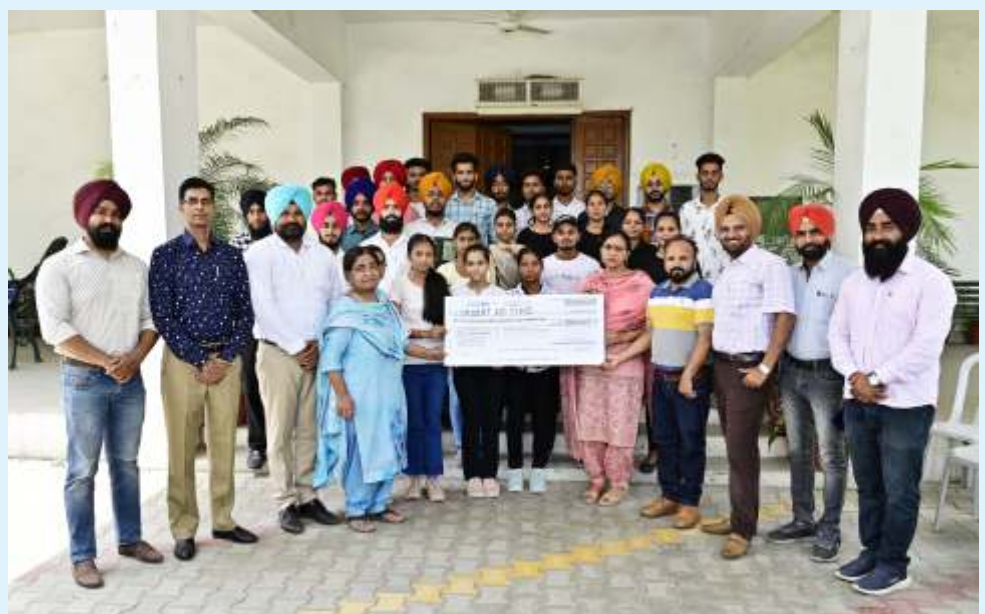
Students receiving Financial Aid in the form of Cheque from the College

The students of the college are provided with the facility of bus passes at concessional rates. For this, the students have to fill a prescribed form and get it attested from the tutor. Two photographs are required for the bus pass. Passes are issued by PEPSU Road Transport Corporation and Punjab Roadways.